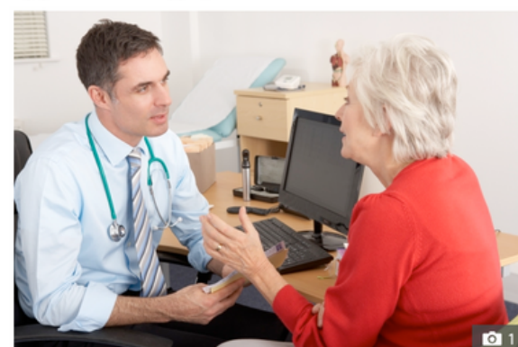
From May 15, GPs will have to provide patients with an appointment right away.

From May 15, GPs that cannot offer an appointment right away will be obliged to provide people with an assessment there and then - or signpost them to an 'appropriate medical service'.