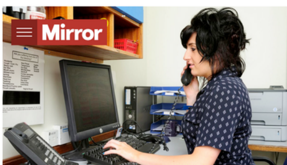
The 8am appointment scramble could be a thing of the past. Image: Getty Images

NEWS POLITICS FOOTBALL CELEBS TV ROYALS MONEY